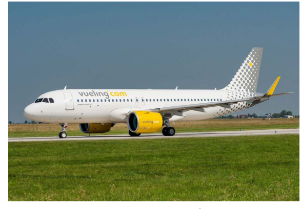
As of July , 2023 , the Vueling carrier will connect Prague and the largest