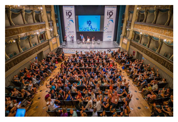
The 9th year of the largest conference for digital content

creators in Europe, Traverse, will be held in Brno on Sept. 16-18, 2022. Up to four hundred of the best European and global influencers, bloggers, Instagrammers and YouTubers are expected in the South Moravian metropolis. The conference's coorganizers are the CzechTourism agency, the City of Brno and the South Moravian Tourist Board. The Traverse Conference is an educational platform that attracts hundreds of digital content creators from around the world every year. During the two conference days, dozens of seminars and presentations dealing with online marketing and content creation will take place. More at www.traverse-events. com/traverse22/