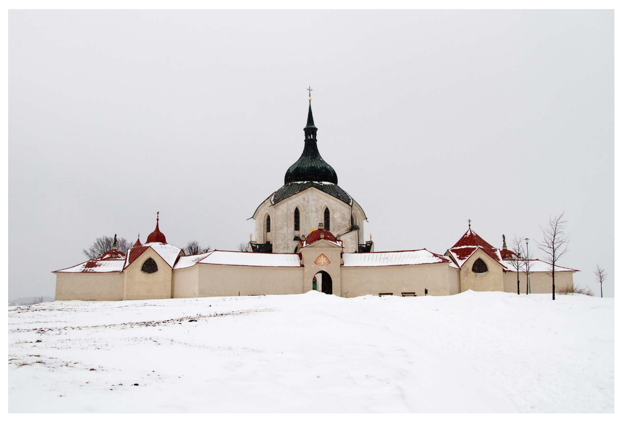
Pilgrimage church of St John of Nepomuk at Zelená hora